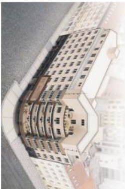
PODLAŽÍ / FLOOR

www.londonhouse.cz , info@londonhouse.cz