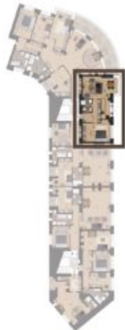
VMĚRA BYTU / FLAT AREA