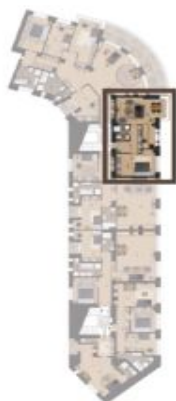
VÝMĚRA BYTU / FLAT AREA