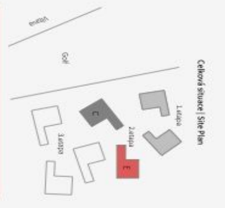
Celková situace | Site Plan