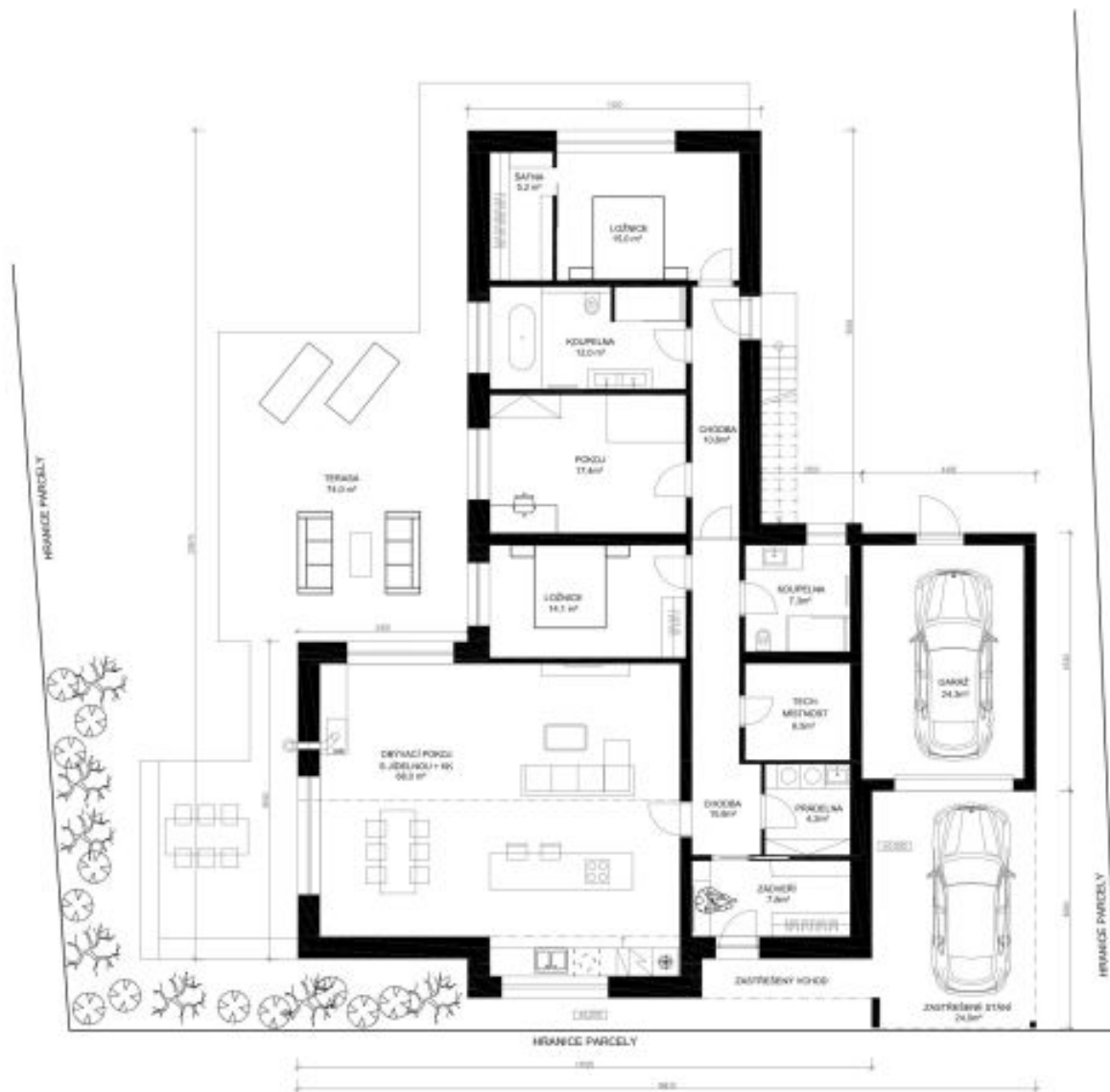
PŮDORYS 1NP - V KONTEXTU PARTERU