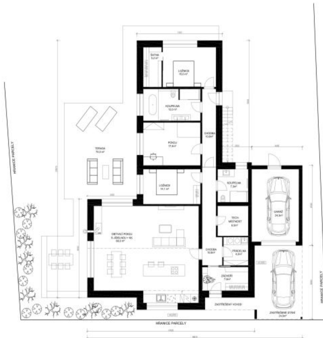
PŮDORYS 1NP - V KONTEXTU PARTERU