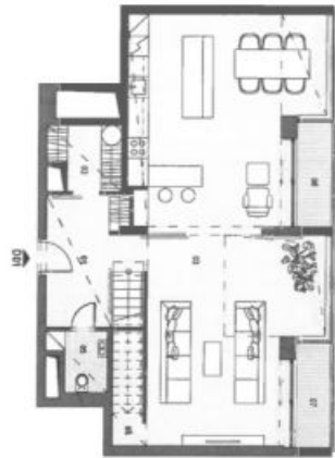
1. PATRO VSTUPNÍ PODLAŽÍ