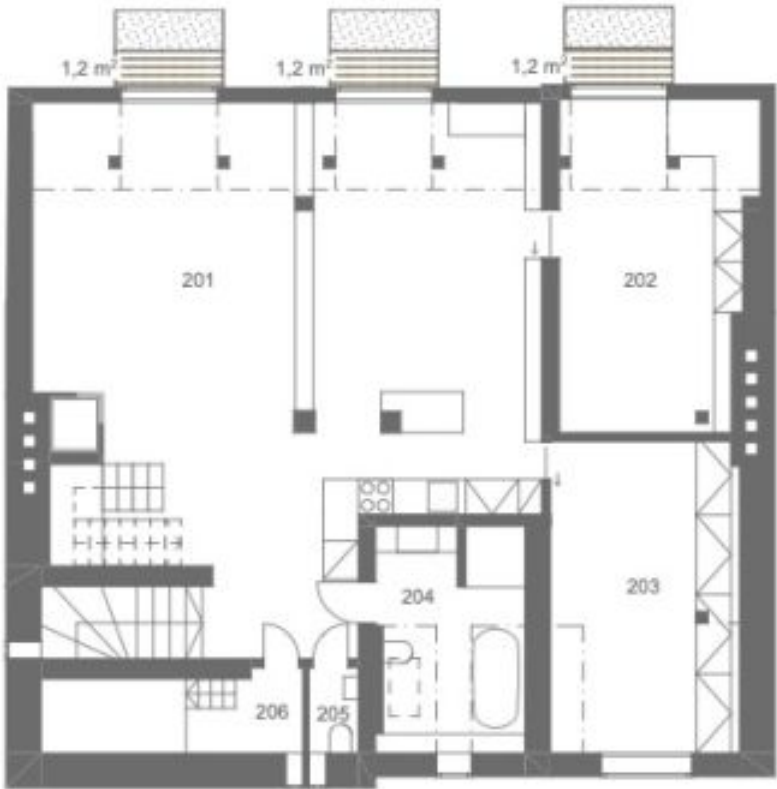
Čistá podlahová plocha místností:

214 m², Prague 1, Staré Město, Vejvodova