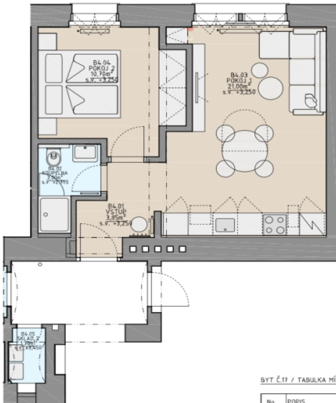
BYT Č.17 / TABULKA MÍSTNOSTÍ