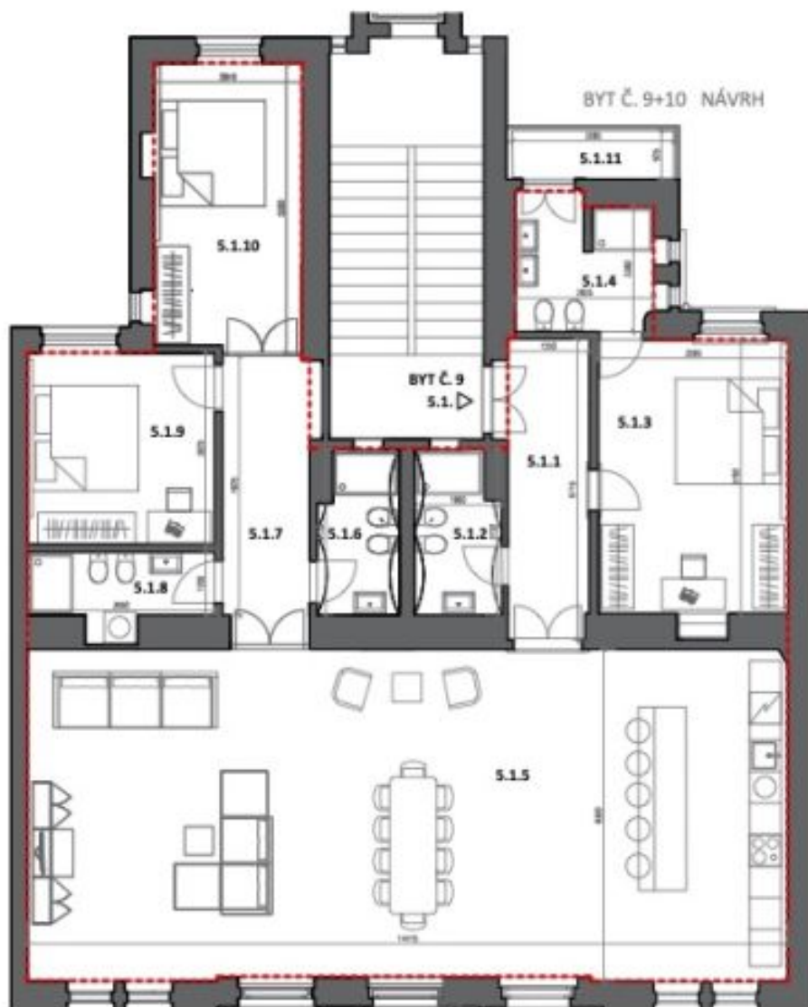
KŘÍŽOVNICKÁ 6, STARÉ MĚSTO PRAHA 1 BYT Č. 9+10 NÁVRH

172 m 2 , Prague 1, Staré Město, Křižovnická