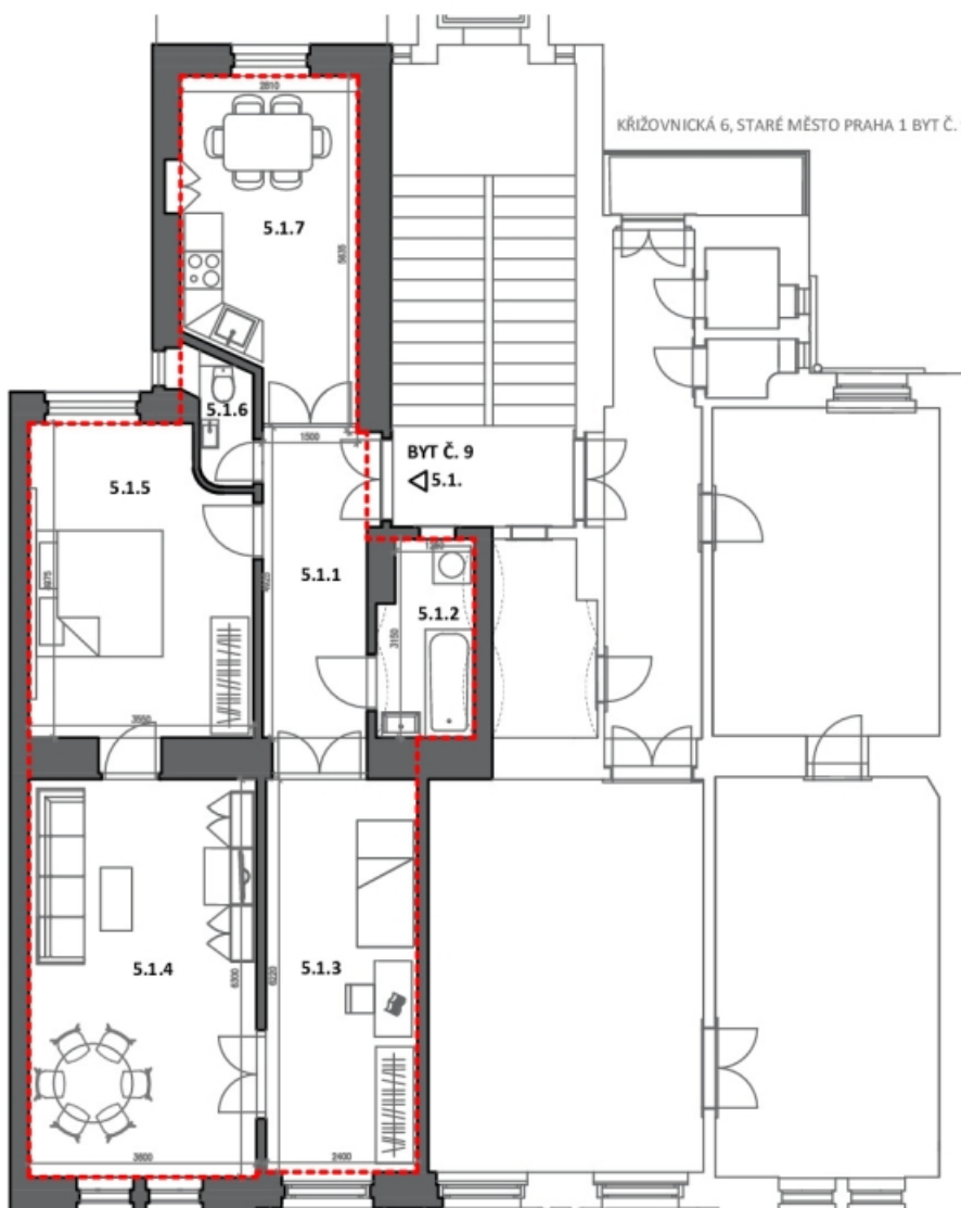
KŘÍŽOVNICKÁ 6, STARÉ MĚSTO PRAHA 1 BYT Č. 9 STAVAJÍCÍ STAV

89.9 m 2 , Prague 1, Staré Město, Křižovnická