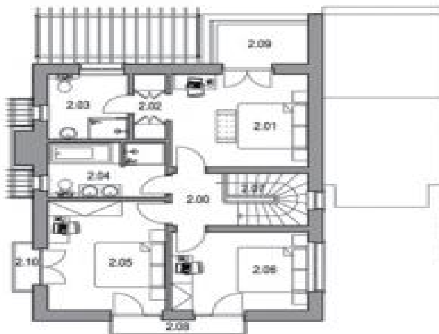
PŮDORYS 2.NP / FIRST FLOOR