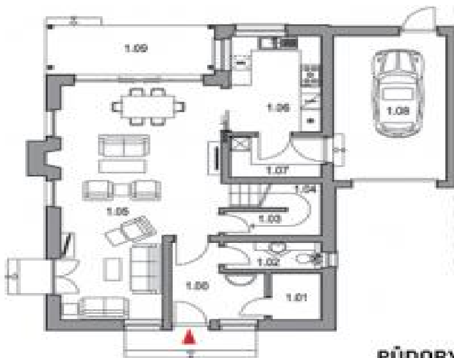
PŮDORYS 1.NP / GROUND FLOOR