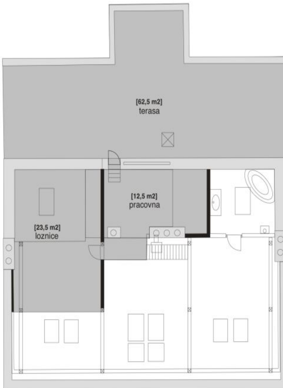
patro s terasou