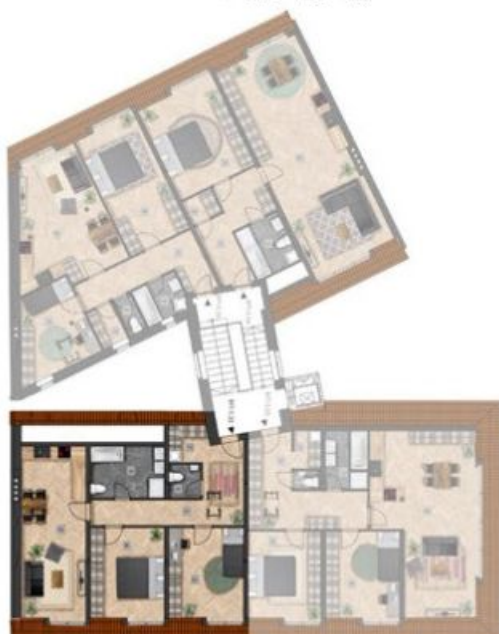
umístění bytu na patře