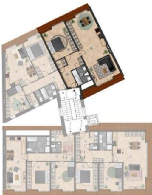
umístění bytu na patře