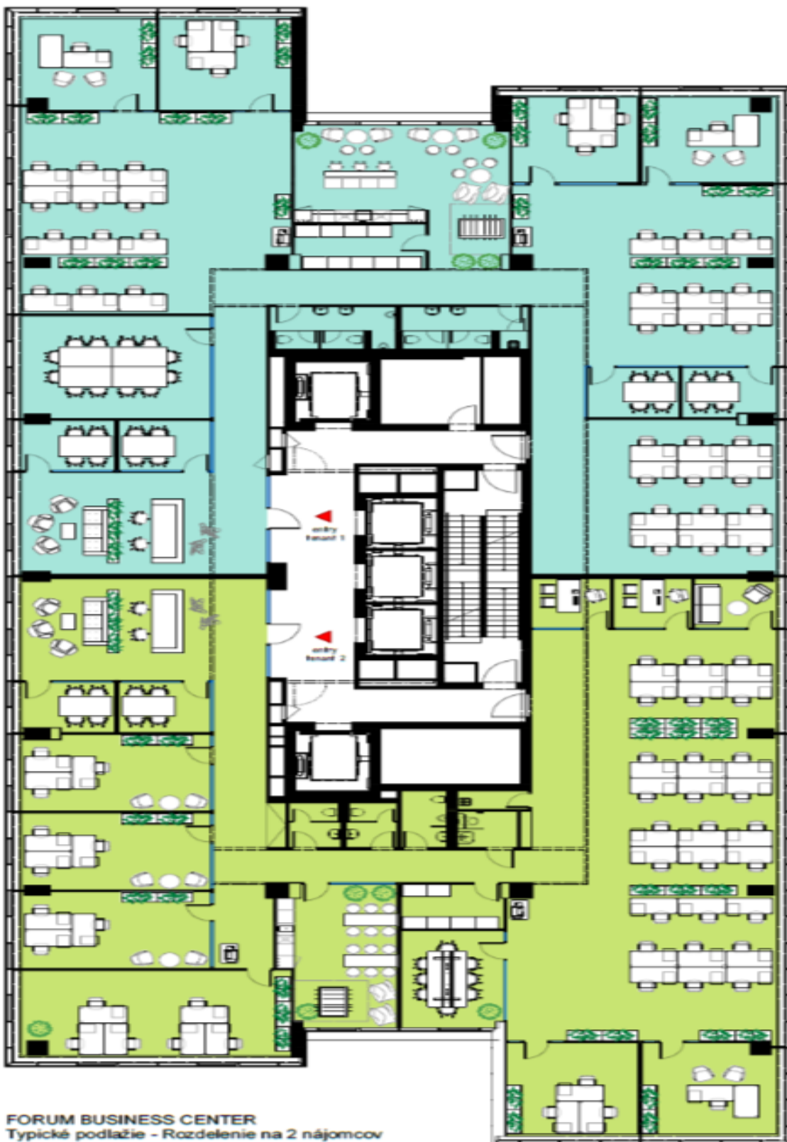
FORUM BUSINESS CENTER Typické podlažie - Rozdelenie na 2 nájomcov