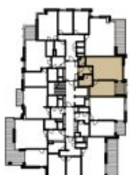
schema podlaží schematic floor plan

Upozornění: Plochy jednotlivých místností jsou pouze orientační. Vybavené zařízení v plánech bytů (nábytek, kuch. linka, el. spotřebiče atd.) není součástí dodávky. Rozsah dodávky je specifikován ve standardu. Note: This drawing is for illustration only. The set up of interior (furniture, kitchen, el. appliance, etc.) featured in the apartment drawings is not subject of delivery. The scope of delivery is specified in the standard. (21.10.2015)