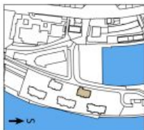
poloha domu / location of the house