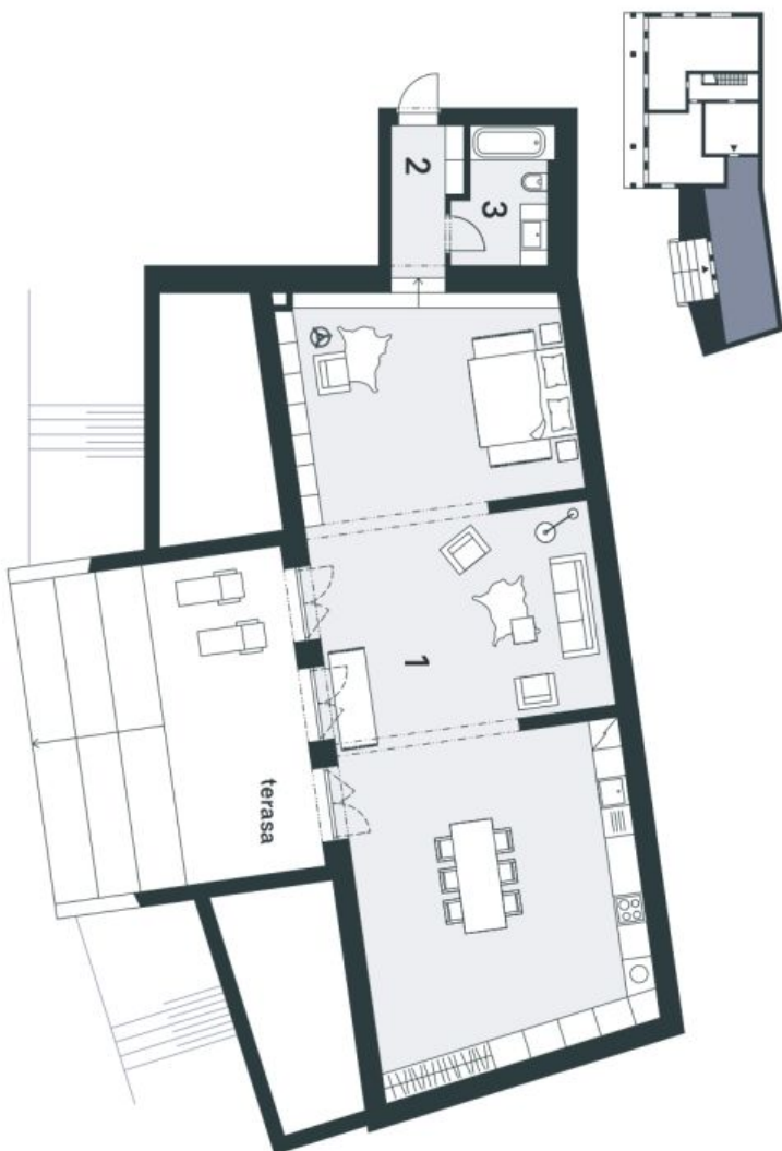
Schéma podkrovy bytu představuje dispozici řešení bytu. Kuchynská linka a nábytek nejsou součástí dodávky bytu, zařízení je zobrazeno pouze pro názornost. Plocha zahrady je orientační. Specifikace pro konstrukce, povrchové úpravy a rozsah vybavení je předmětem přílohy "Standard nemovitosti".

svoboda&williams | CHRISTIE'S INTERNATIONAL REAL ESTATE