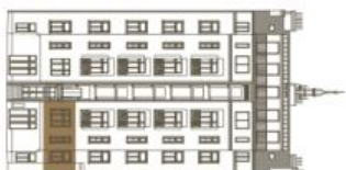
Schéma půdorysu bytu představuje dispozici řešení bytu. Kuchyňská linka a nábytek nejsou součástí dodávky bytu, zařízení je zobrazeno pouze pro názornost. Plocha zahrady je orientační. Specifikace pro konstrukce, povrchové úpravy a rozsah vybavení je předmětem přílohy "Standard nemovitosti".

svoboda&williams | CHRISTIE'S INTERNATIONAL REAL ESTATE