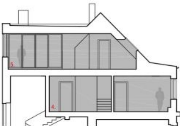
LEGENDA / LEGEND