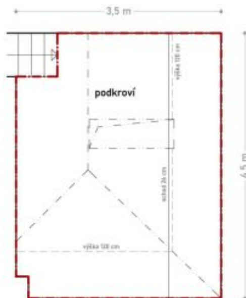
podlahová plocha podkroví 15,1 m 2