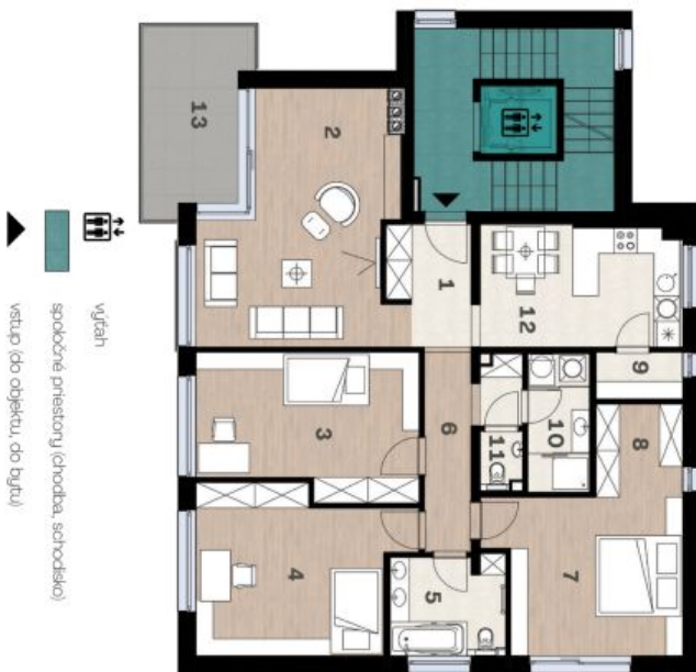
Schéma pôdorysu domu predstavuje dispozíciu niektorých priestorov bytu. Developer si vyhradzuje právo na zmeny a úpravy bez predchádzajúceho upozornenia.