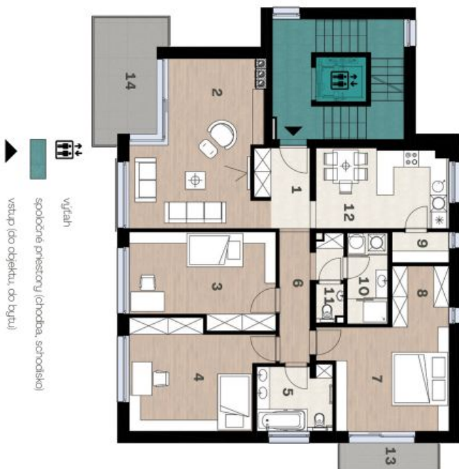
Schéma pôdorysu domu predstavuje dispozíciu nehnuteľného objektu. Developer si vyhradzuje právo na zmenu a upresnenie bez predvýstrahy a upozornenia.