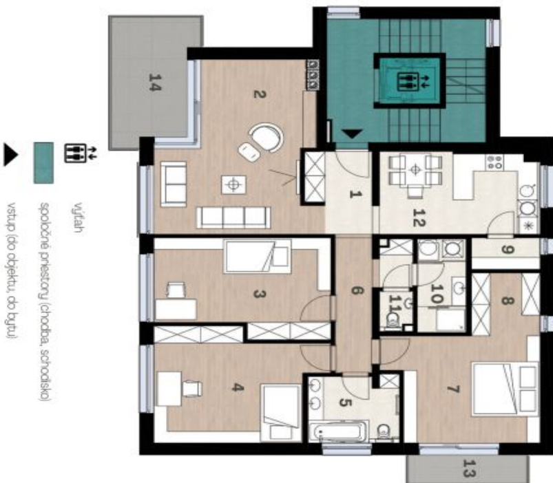
Schéma pôdorysu domu predstavuje dispozíciu resp. výstavbu bytu. Developer si vyhradzuje právo na zmenu a upresnenie bez predchádzajúceho upozornenia.