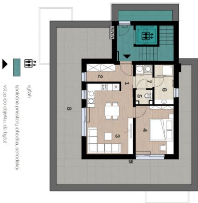
Schéma pôdorysu domu predstavuje dispozíciu interiéru bytu. Developer si vyhradzuje právo na zmenu a upresnenie bez predchádzajúceho upozornenia.