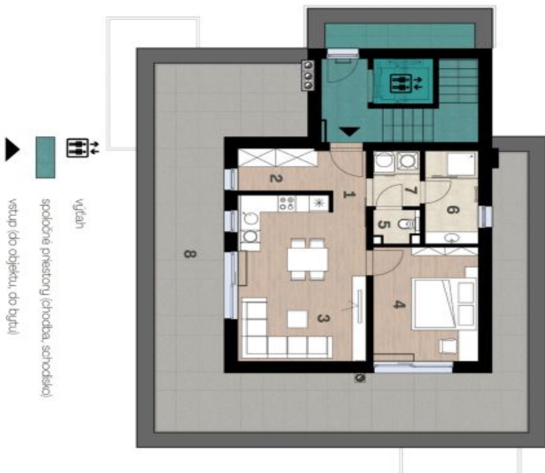
Schéma pôdorysu domu predstavuje dispozíciu miestností bytu. Developer si vyhradzuje právo na zmeny a upravenia bez predchádzajúceho upozornenia.