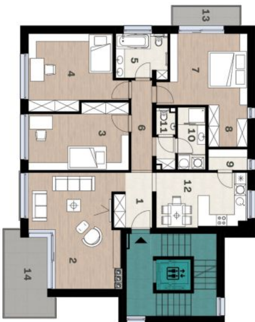
Schéma pôdorysu domu predstavuje dispozíciu nesebečiasne bytu. Developer si vyhradzuje právo na zmeny a úpravy bez predvýstrahy a upozornenia.