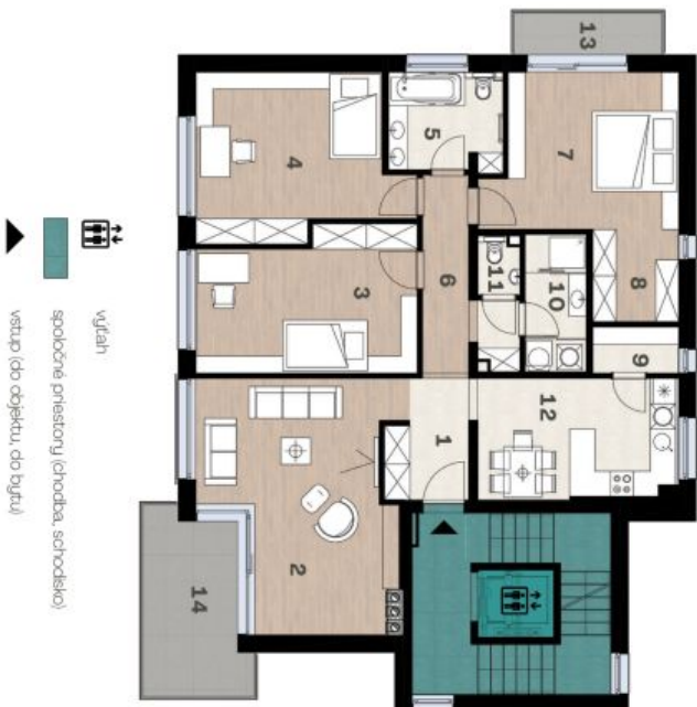
Schéma pôdorysu domu predstavuje dispozíciu miestností bytu. Developer si vyhradzuje právo na zmeny a úpravy bez predchádzajúceho upozornenia.