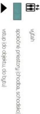
Schéma pôdorysu domu predstavuje dispozíciu resp. výstavbu bytu. Developer si vyhradzuje právo na zmenu a upresnenie bez predchádzajúceho upozornenia.