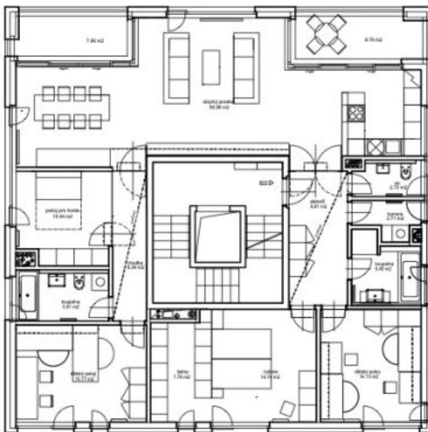
schéma bytu B21+B22 - 2np

151 m 2 , Prague 4, Podolí, Na Hřebenech I