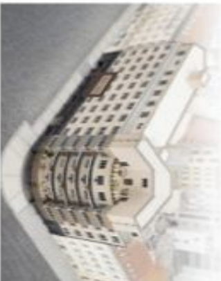
PODLAŽÍ / FLOOR