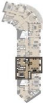
VÝMĚRA BYTU / FLAT AREA