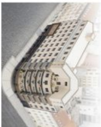
PODLAŽÍ / FLOOR