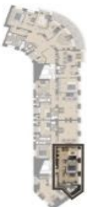
VÝMĚRA BYTU / FLAT AREA