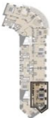
VÝMĚRA BYTU / FLAT AREA