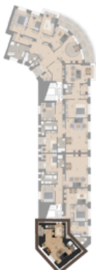
VÝMĚRA BYTU / FLAT AREA