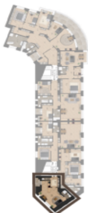
VÝMĚRA BYTU / FLAT AREA