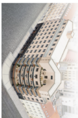
PODLAŽÍ / FLOOR