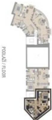
PÓDLAŽÍ / FLOOR